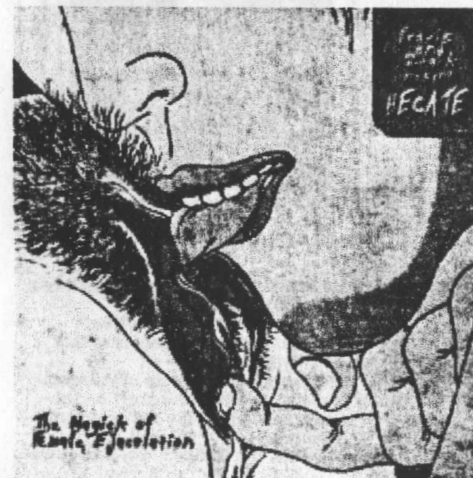
finally out is Hekate's first album (for the moment double 12" only, CD later) The Magick of Female Ejaculation , delayed because of a printer's refusal to handle the cover due to its erotic content...!?

The situation in Germany is quite different (and readers living in the country-side may excuse me concentrating on the three capitals here), in Berlin there has been pretty much zero tolerance for free parties for a long time, and in this city famous for its squatting history is not a single actual squat left. Contrary to London and Paris the price for